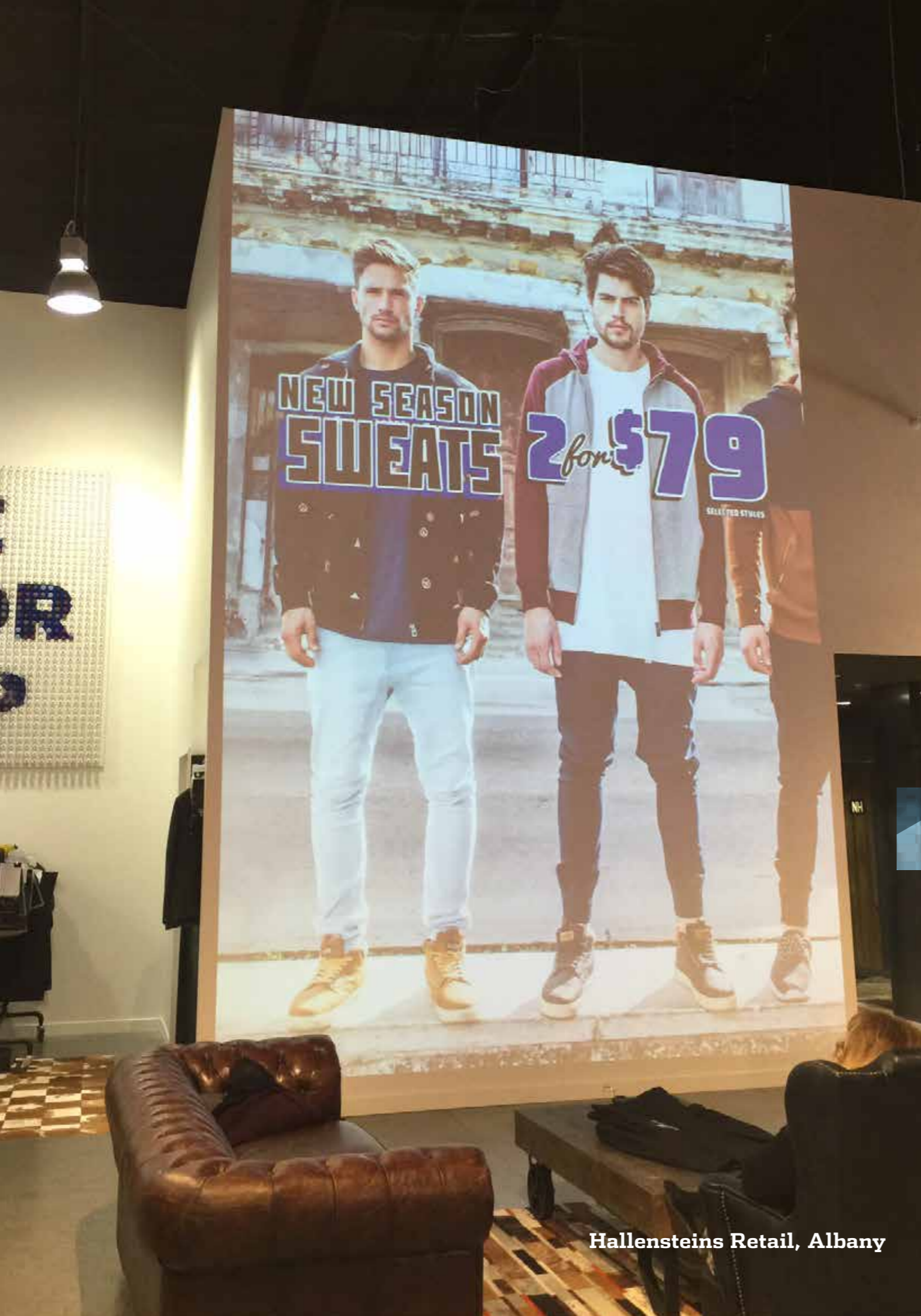
Hallensteins Retail, Albany

We thoroughly enjoyed working for this inspirational client - she sourced the most beautiful fittings and worked with great care throughout the project, from planning to completion. She asked us to install a fully integrated system comprising audio and video door entry at the gate and front door; CCTV cameras; full house WiFi and fast wired networking; and high definition TV distribution from central sources located out of sight in a rack hidden in the hallway. The result was outstanding.